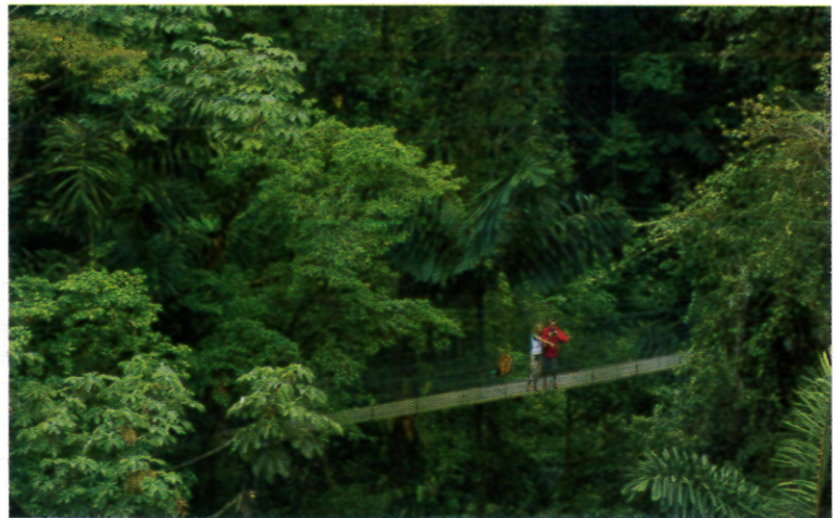
Ecotourism helps protect approximately two-thirds of Costa Rica's undisturbed tropical rain forests. Hanging bridges, like the one above, are used to protect the rain forest floors while tourists admire the landscape. (For more on tropical rain forests, see pages 30 and 120.)