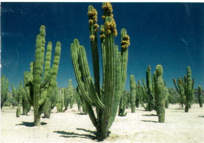
The Sonoran Desert is wetter than most deserts, receiving up to 12 inches (300 millimeters) of rain each year. Its summer rainy season sustains a variety of plants and animals—over 20 percent of Mexico's plant species.