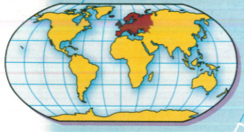
Area shown on cross section