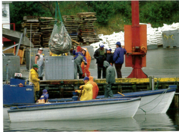
Canada exports nearly US$3 billion worth of fish and fish products. These fishermen are unloading their day's catch of cod in Petty Harbour, Newfoundland and Labrador. Overfishing in Canadian waters has critically endangered several species of fish.